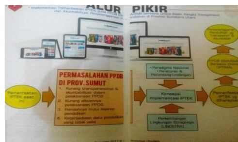
Figure 1. Flowchart of PPDB Online Implementation

The following is the flow of thought for the implementation of PPDB Online in the Province of Sumatra North :