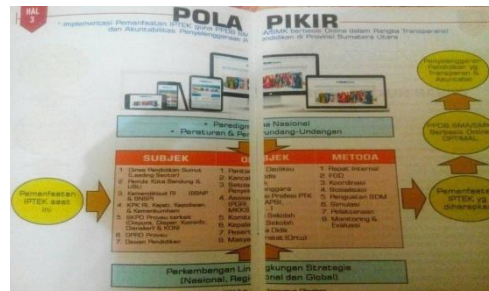
Figure 2. PPDB Online Implementation Mindset

change the behavior of people who have been accustomed to bribery activities so that they can enter certain schools now with this system it is no longer possible.