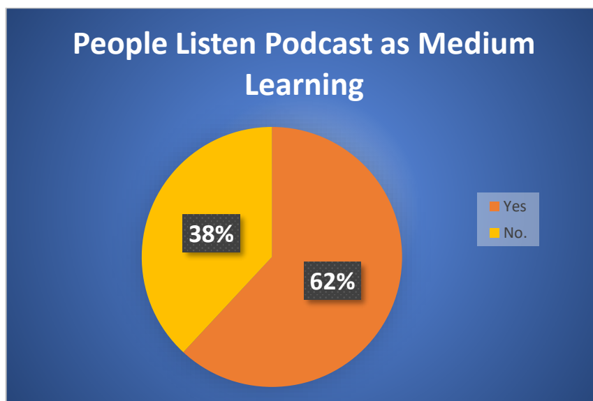
Figure 3. People Listen to Podcast as Medium Learning

Similar to radio, finding a radio station is the first step. After finding the desired channel, users can subscribe. When users subscribing to a channel, there will be a notification to users for new episodes. 62% of users listened to a podcast as a learning medium alternative because they are bored with the conventional learning method. In the second quarter of 2019, published by Spotify, the growth of podcast listeners is claimed to have increased as much as 50% over the previous quarter. Party Spotify itself has announced that Indonesia is the only market in Asia with the fastest growth in content consumption of audio [13]. Users need an extraordinary method of learning, and they feel that by getting learning knowledge from podcasts, they will get additional knowledge that may not be obtained when learning is carried out as usual, especially amidst the pandemic. Meanwhile, 38% of users listened to a podcast just to get other entertainment (See Figure 3).