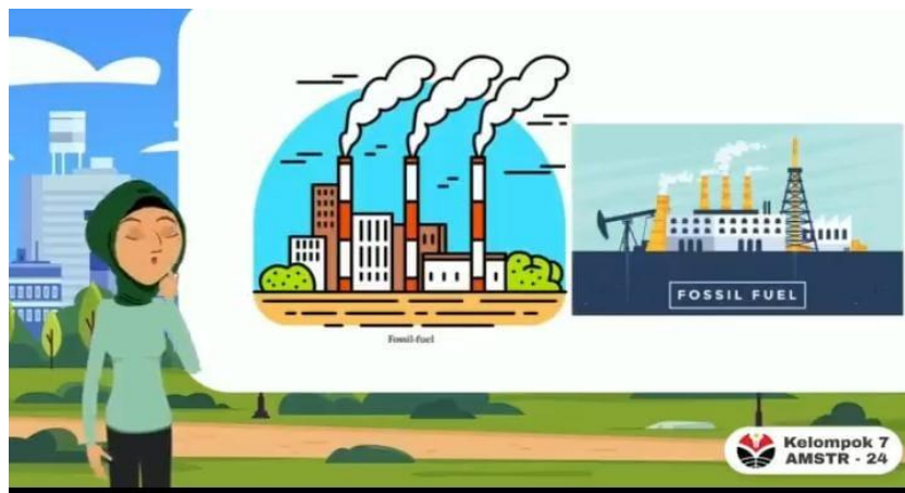
Figure 2. Education video