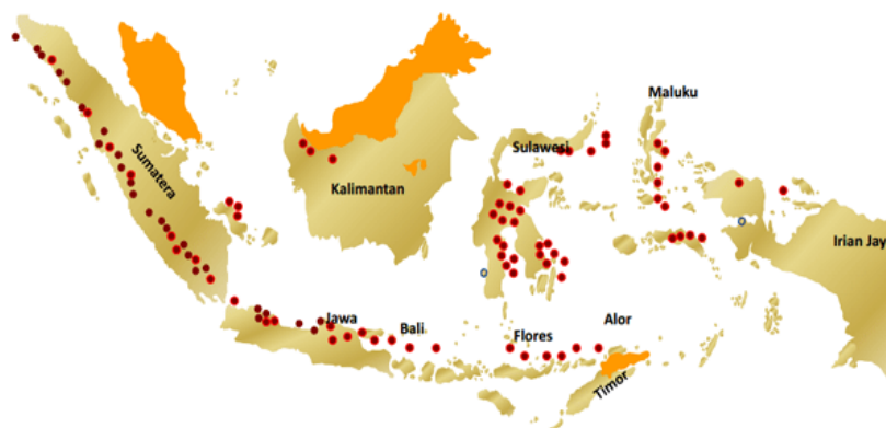
Figure 3. Geothermal distribution map

The vapor that comes out of the furnace will then enter the condenser to be condensed. The vapor will change its form to liquid which is called condensate. The condensate is then drained into the cooling room to cool the temperature. Then the relatively cooled water is injected back into the earth through the injection well. This is what makes geothermal energy a sustainable energy (Mahood et al. , 2015).