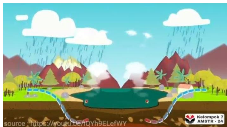
Figure 4. Geothermal processing