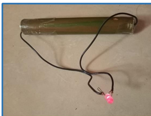
Figure 2. Application of bio battery with fruit electrolyte to LED light.