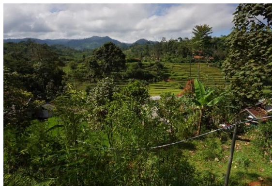
Figure 3. Install The Water Pipe