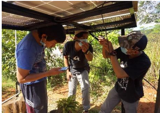
Figure 2. Install The Solar Panel

The system has been implemented in Sirnajaya Village, the documentation can be seen in the figures.