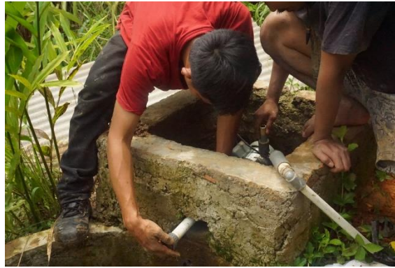
Figure 5. Install The Water Pump