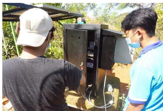
Figure 4. Install The Controlling System