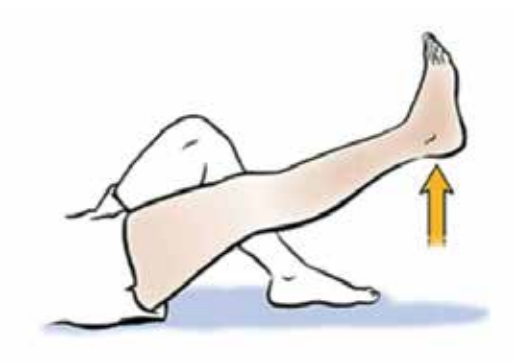
Figure 7. Straight Leg Raise

While lying flat on the back with uninvolved leg bent and your foot flat on the surface, tighten thigh and lift the involved leg. Keep the knee straight. Only lift to the height of the uninvolved knee.