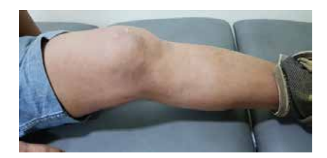
Figure 1. Left Knee Appearance

On physical examination, he walk in antalgic gait, vital signs were normal, from the localized examination, inspection of lower extremity, there was mild edema on the left knee, with no muscle atrophy. From palpation, felt warm and pain. There was limitation in range of motion of left knee. It found there was limitation in full passive extension and flexion. In neutral position, the flexion was 15°, passive extension cannot be achieved and still in flexion 15°, passive flexion was 30°. Ligamentous laxity test was difficult to be examined because of pain.