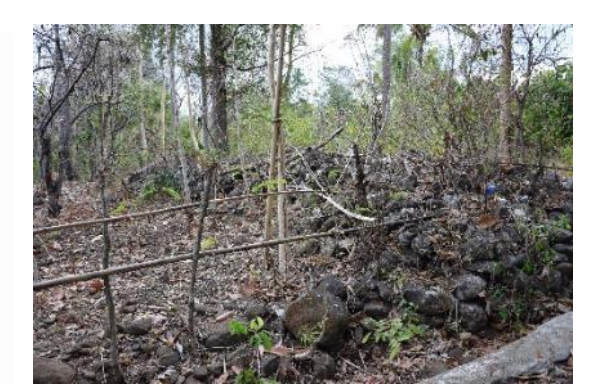
Fig. 1. The ruin of fortress of Pattojo

At first, Datu pattojo's private house was inside the Pattojo fortress and then moved to build outside the castle. Model of the house no longer follows the shape of the existing house that is inside the castle. Ke-datu-an Pattojo reshape the structure of the power territory, where the house overlooks the square that serves as a gathering place for the community. The king or queen can interact directly with her people or activities in the square that as alun-alun at the time.