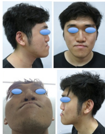
Figure 1. Pre-treatment extra-oral photographs

We present here a case of a patient with bilateral cleft lip, palate and alveolus who underwent orthognathic surgery combined with orthodontic treatment without previous alveolar bone graft.