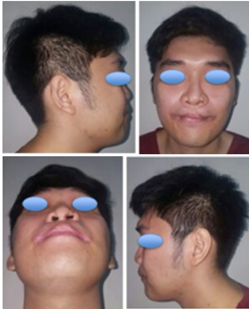
Figure 9. Four months post maxillary advancement & mandibular setback