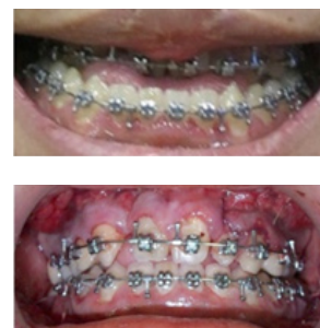
Figure 8. Pre and post-treatment intraoral photograph

He is scheduled to have a pharyngoplasty and a rhinoplasty.