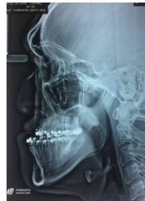
Figure 3. Pre-treatment lateral cephalometric radiograph

According to Wendell Wylie Method, the patients sustained prognathic mandible (Angle's class III malocclusion) with prognathic and retrognathic measurement of 39.5 and 5 respectively. In accordance to Downs method, radiographic evaluation shows maxillary retrusion, mandibular prognathism, class III occlusion. CT scan reveals bilateral alveolar clefts which are practically complete, very