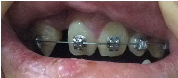
Figure 2. Pre-treatment intraoral examination

On clinical examination, the patient revealed concave facial profile with a retrusive upper lip and protruded chin (retrognathic maxilla and prognathic mandible). The maxilla was smaller and located in a more posterior and upward position and both cheeks were flat. The facial proportion revealed a lower third was longer compared to the middle third. The upper lip showed whistle deformity.