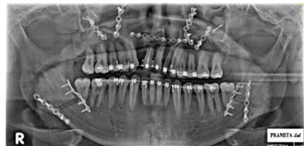
Figure 7. Post-treatment cephalogram