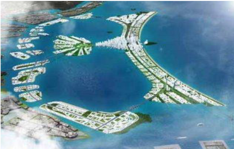
Picture 3 Overview of Jakarta Northern Coast Reclamation Plan

Source: http://ncicd.com/2014/10/page/3/