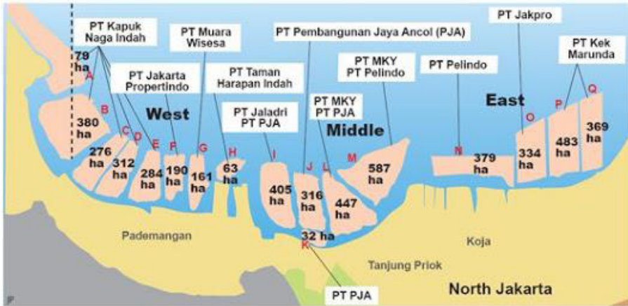
Picture 1. Map of Northern Jakarta Coast Reclamations Plan Division

Source: The Jakarta Post, November 6, 2015, Weekly 5: Arguments for, against reclamation.