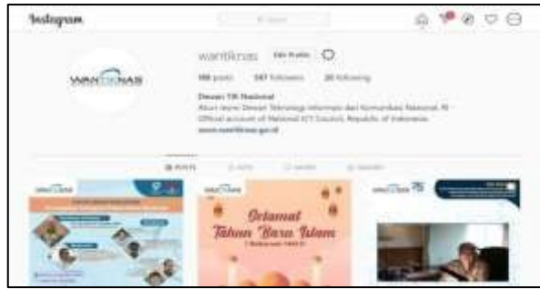
Picture 3. Instagram of Wantiknas