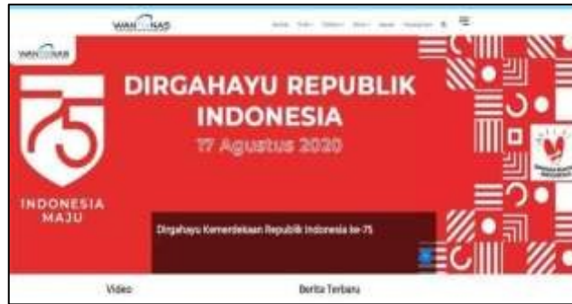
Picture 1. Website of Dewan TIK Nasional

Cyber Public Relations activities of course there are several processes and stages. Public Relations of WANTIKNAS uses the website as the official media to convey information and introduces the profile of WANTIKNAS as the identity of the WANTIKNAS agency. In addition, the official website also contains content related to activities carried out by WANTIKNAS.