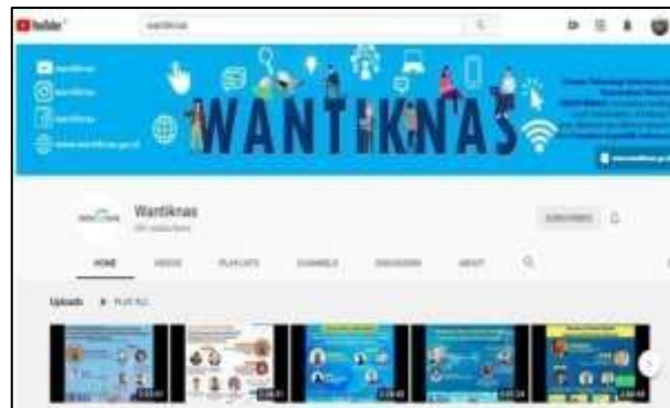
Picture 4. Youtube Wantiknas

Social media has indeed become one of the new alternatives that is quite practical and fast for disseminating information, especially in public relations activities. Besides being fast and not consuming a lot of budget, it is also a medium to encourage the existence of WANTIKNAS through its public relations function so that it is increasingly known to the public. Developments also affect the way WANTIKNAS public relations work by using social media.