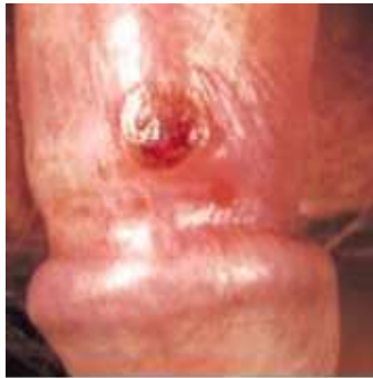
Figure 1. There is an ulcer with induration on a clean basis (Sitanela, 2019).