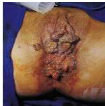
Figure 7. Condyloma acuminata in women (Sitanela, 2019).