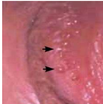
Figure 8. Vesicles on the vulva. (Leruez-Ville et al., 2020)