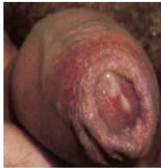
Figure 4. Overview of discharge in men (Sitanala, 2019).

accompanied by blood. In neonates, there may be a pain in the eyes, redness, and purulent pus (Sitanala, 2019). Subjective complaints in the form of itching, heat in the distal urethra around the external urethral orifice, can also be accompanied by pain during erection. On examination, the external urethral orifice mucosa appears hyperemic, edematous, and sometimes ectropion is found. (Batubara et al., n.d.)