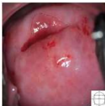
Figure 5. Strawberry appearance in trichomoniasis. (Norseth et al., 2014)

Clinical symptoms of this trichomoniasis differ between women and men. In women, seropurulent to mucopurulent vaginal discharge may be yellowish, yellow-green, odorless, and frothy. The vaginal wall will also appear red and swollen, can form small abscesses on the vaginal wall and cervix known as the strawberry appearance , and is accompanied by symptoms of dyspareunia, postcoital bleeding, and intermenstrual bleeding. In men, the clinical picture that occurs is generally lighter than in women, for example, dysuria, polyuria with mucopurulent urethral secretions. (Menaldi, 2015)