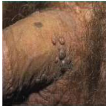
Figure 6. Condyloma acuminata in men (Sitanela, 2019).

Clinical symptoms in Condyloma acuminata are accompanied by a clinical form were the most frequently found are cauliflower-like lesions, colored like mucosa. While the clinical symptoms can be in the form of itching, if infected it causes pain, odor, and easy bleeding. (Menaldi, 2015)