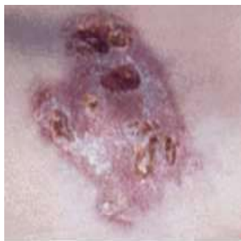
Figure 3. A tertiary syphilitic lesion with nodules with superficial ulceration (Sitanela, 2019).