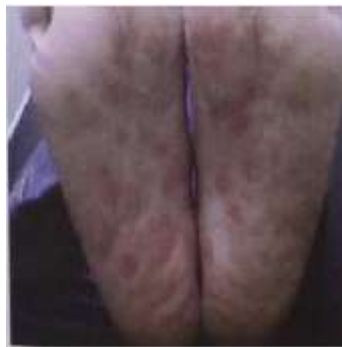
Figure 2. Secondary syphilis on the soles of the feet (Sitanela, 2019).