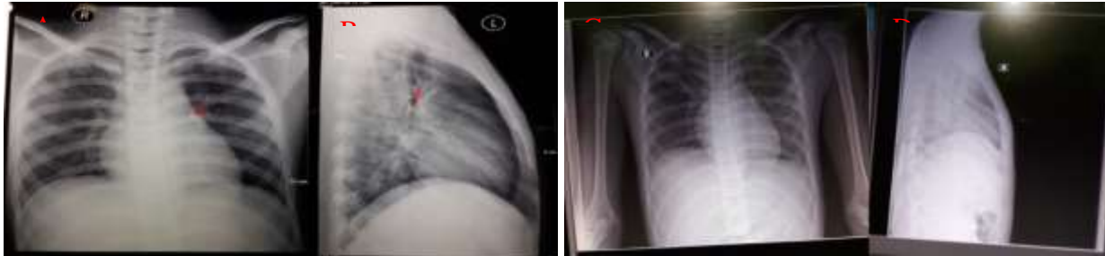
Figure 1 Comparison of Chest x-ray: A. Anteroposterior projection (AP) B. Left lateral projection (taken on 13 th Februari 2017), Initial chest x-ray showed a spike shaped metal density on the left hilum at the level of 6 th thoracic vertebrae. C. Anteroposterior projection (AP) D. Left lateral projection (taken on 17th Februari 2017) Chest x-ray after rigid bronchoscopy extraction, pulmos are normal and no foreign body found.

abnormalities (Figure 1C-D). The patient was then discharged.