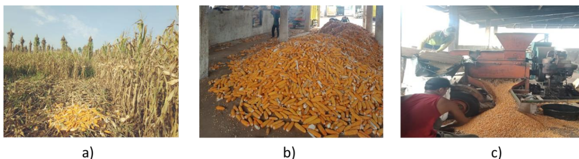
Figure 1. a) Maize in field; b) Maize after move from farm to thresher; c) Maize that ready to send to factory

The three different points in maize distribution trade, maize in field, maize after move from farm to thresher and maize that ready to send to factory showed in Figure 1.