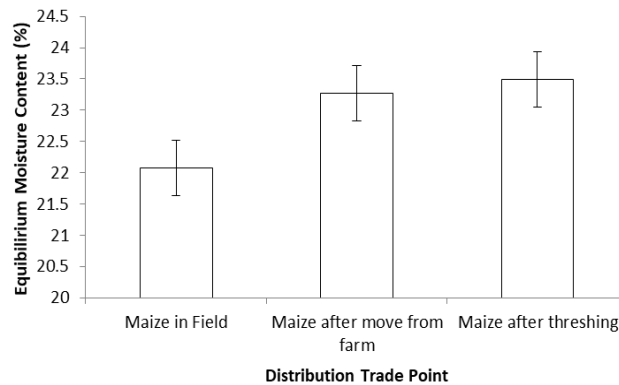
Figure 4. The Equilibrium Moisture Content in different point of distribution trade (three times replicate)

in the location maize after threshing ( 23.49 \pm 0.58\% ). The finding of highest EMC after maize threshing because of its high temperature and RH. Different types of grains require different amount of moisture level for storage (Hanif et al., 2018).