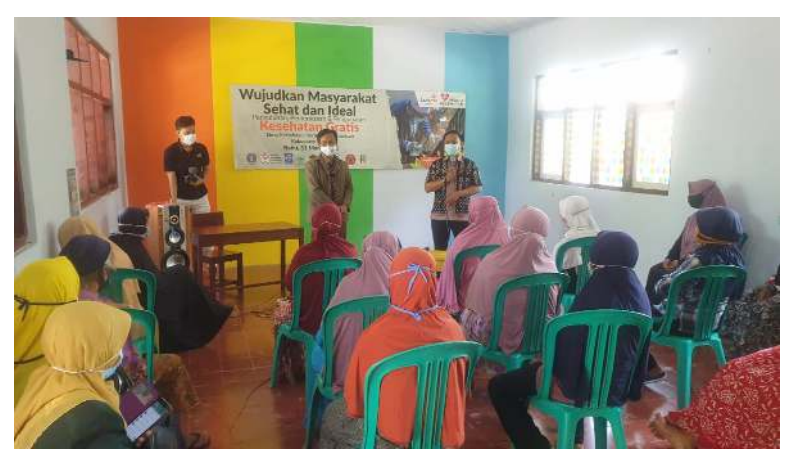
Figure 1. Pre-post Implementation Evaluation