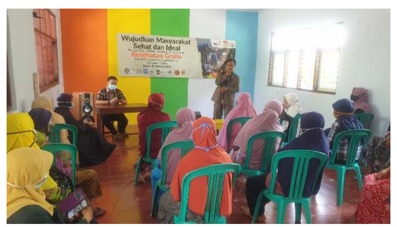
Figure 2. Lecturing of The Main Material and Discussion