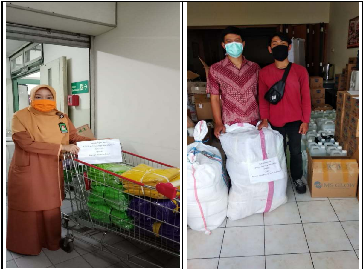
Figure 3. Handing over of personal protective equipment and supplements (Advanced)