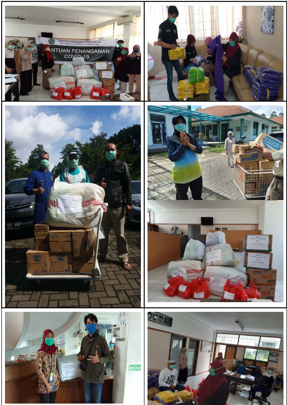
Figure 2. Handing over of personal protective equipment and supplements