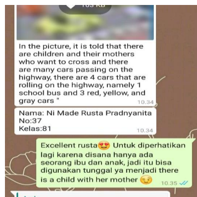
Figure 2. Teachers' Feedback

Teachers said that E-portfolios help teachers and also students to recall students' works and teachers' feedback. In this case, all of the students' works and also teachers' feedback were collected in one folder on a platform. By having e-portfolios teachers could see their students' improvement easily and students also could see what should be improved in every project easily. Amaya et al., (2013) said that the use of e-portfolios is very important to improve the teaching and learning process as well as student assessment. They added that by implementing an e-portfolio, students have a record of their progress and feedback from the teacher, so that they can improve their skills. Then, teachers also asked students to do self-assessment. This often happened on students' written projects. When students did self-assessment, students could discover their ability on certain skill. It also means that by doing self-assessment, students can find their weaknesses and their strengths. Besides, students also can learn to be independent and making best decision for their learning process. Lastly,