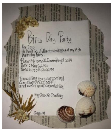
Figure 5. Project Task

States et al., (2018) stated that Summative assessment includes midterms, final assignments, papers, teacher-designed tests, standardized tests, and high-stakes tests. A study conducted by Parkes and Zimmaro (2018) showed that Multiple Choice Questions (MCQ) is the most common assessment method and is often used in summative assessment. However, multiple choice questions cannot be used to assess higher level skills so it was also found that students who can successfully complete multiple choice questions do not perform well in their essay test. Moreover, they said that essay test should be conducted more often in online environment to practice students' higher order thinking. This also in line with a research conducted by Perera-Diltz and Moe (2014) which stated that Mid-term and final-exam must be given at the end of each semester. This can be done most easily by giving multiple choice questions. However, another option that must also be considered is the provision of long and short answers, to measure students' higher abilities.