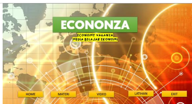
Figure 1. Main Menu

The initial display design of an Android-based multimedia application uses a pilot in everyday life to make it easier to understand.