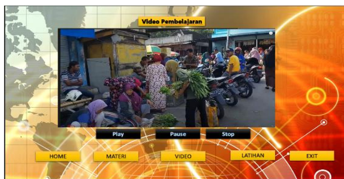
Figure 3. Learning Videos

Android-based multimedia in the tenth grade of economics learning, especially about economics, displays are learning videos that allow students to learn from reading material and understand through learning videos that already exist in the developed teaching media.