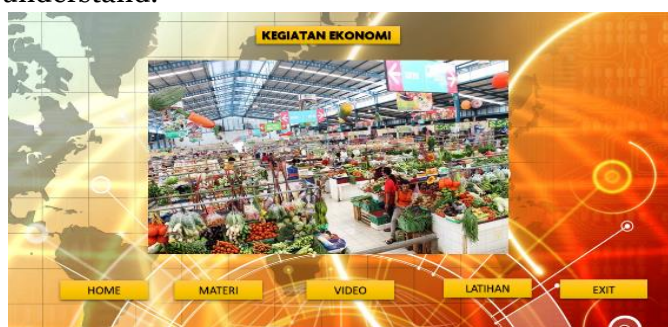
Figure 2. Material

The initial display design of an Android-based multimedia application uses a pilot in everyday life to make it easier to understand.