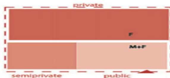
Fig. 2. Organization of Islamic dwelling house (Ibrahim, 2012)

The benefit of this law enforcement is to avoid any unwanted matters such as seeing the unpleasantness or defects of the resident. In addition, asking for permission gives time to the host and the chance for them to accept the external party. The right to respect others is also recognized as the home is the only property that can be entered through the authorized route. To maintain privacy, the design of the entrances either at the front or the rear should not face the road directly. It is also advised not to arrange the door to collide with or in line with another residential unit (Abdul Hamid, 2010). For multi-story dwelling houses, closed staircases need to be designed to maintain residents' privacy according to the concept of awrah (Mohamad Rasdi, 2007). The importance of privacy in Muslim life is seen in the clear division of the different areas of the house. Male and female areas are separated, and only select visitors are allowed into the private domain of the house, as shown in Figure 2.