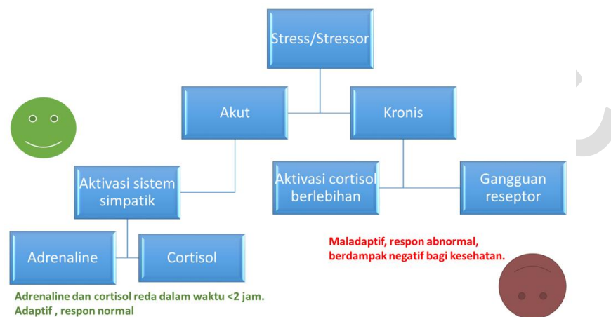
Figure 1. Acute Stress and Chronic Stress

activation process will disappear in less than two hours. In comparison, chronic stress occurs when cortisol activation is excessive, and there is a disturbance in the receptors. This response is an abnormal response that is maladaptive and can harm health (Agatha 2019).