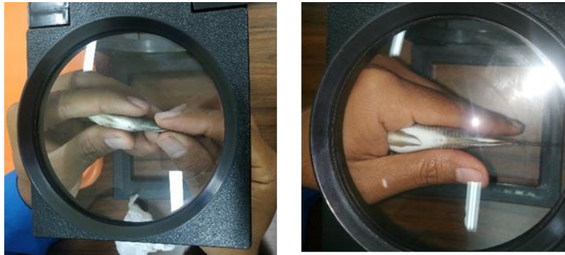
Figure 1. Observation of differences in sex characteristics in tilapia

The results of the observations observed were primary sex characteristics, male and female tilapia can be distinguished based on the number of holes around the anus. In male tilapia, there are two holes, namely the anus and urogenital holes, while in female tilapia there are three holes, namely the anus, ureter and genital holes (Zairin et all, 2003). The results of the differences in the characteristics of male and female fish are presented in Figure 1 (A and B). 50 tilapia fish in each aquarium shows that at a dose of 5 mg / l shows the highest percentage for male sex compared to other doses. The results showed that the testosterone levels in all treated fish at the beginning of the observation were very high compared to the control treatment without giving methyl testosterone