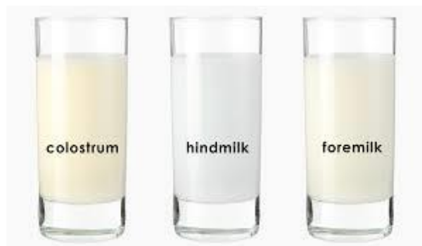
Figure 1. Breast Milk Color

The color in breast milk is not always the same as described in Figure 1. that colostrum is yellowish and thicker because it contains high protein and vitamin A, besides colostrum also contains immune substances which are important to protect babies from infectious and bacterial diseases. Fat-soluble vitamins are higher than mature breast milk. Breast milk released at the first time the milking / pumping process will look "thinner" than the milk released in the next minutes called foremilk (because it is rich in protein) the color tends to be bluish clear white. While the milk that comes out a few minutes later will look thicker, also called hindmilk (rich in fat) in thick white.