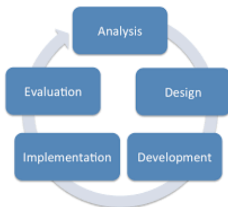
Figure 2. ADDIE Model [6][7]

This study utilized the ADDIE model that consists of Analysis, Design, Development, Implementation and Evaluation [5].