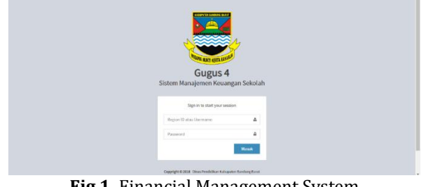
Fig 1. Financial Management System

Based on observations made on the junior subrayon of the West Bandung regency education office conducted on the junior subrayon operator in participating in the use of the school financial management system application, there is a phenomenon that occurs in the reporting of BOS quarter 2 and 3 of 2018 in subrayon 04 as the difference between the estimated cash book balance general with the final balance of SuratPermintaanPengesahanPendapatandanBelanja (SP3B) requested to BadanPengelolaKeuangan Daerah (BPKD) of west Bandung regency as requested in the table below Table 1