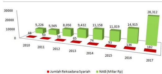
Figure 1. Development of Sharia Mutual Funds and Net Asset Value

experienced the same thing, there was an increase of 441% from 2010 to 2017.