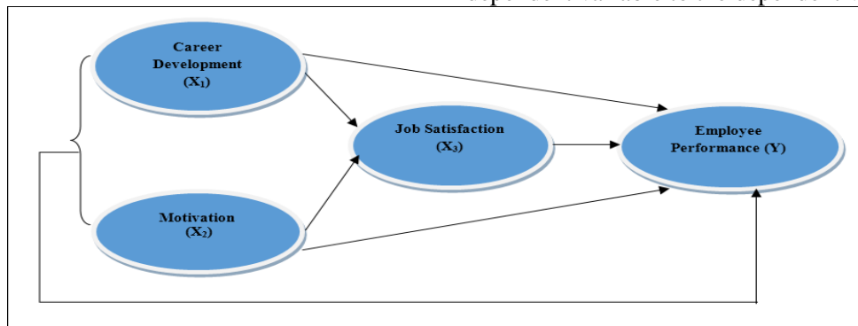
Figure 1. Concept Model

This study uses an explanatory analysis approach. This means that each variable presented in the hypothesis will be observed through testing the causal relationship of the independent variable to the dependent variable.