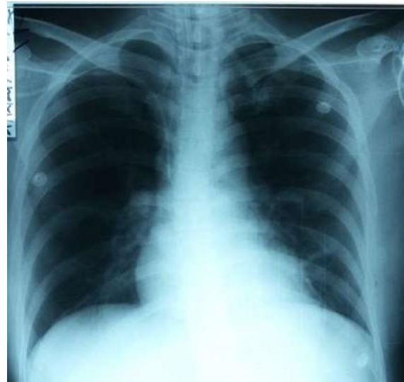
Figure 1. Chest X-ray at the Emergency Department. There is no sign of Pneumonia, normal Chest X-ray

The anticholinergic test was performed by using neostigmine 0,5 mg iv. and the result was positive by decreased respiration rate until normal, then pyridostigmine dose was increased by 60 mg every 4 hours. Even