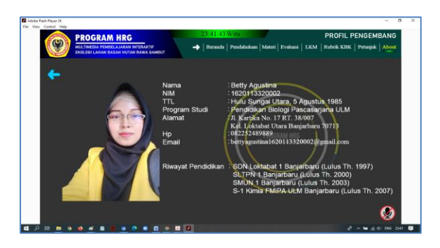
Figure 9 Display of Developer Profile