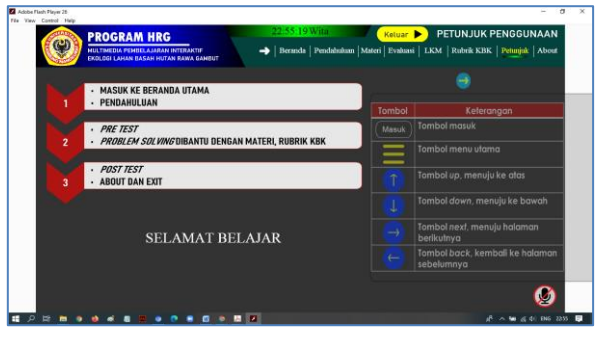
Figure 3. Display Instructions for Use