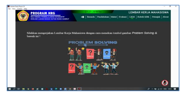
Figure 7 Display of LKM