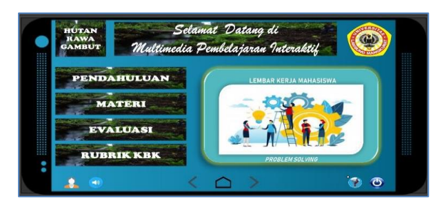
Figure 1 Initial Draft Multimedia Main Home Display (Before Validation)

The designs that have been made are then realized in the form of tools in the form of RPS, LKM, Evaluation Questions, Teaching Materials to the manufacture of multimedia. In multimedia production, researchers used the Adobe Animate CC 2018 application for a media framework which includes the home menu, instructions, introduction, evaluation, LKM, materials, Critical Thinking Skills Rubric, and the About menu as shown in Figure 1.