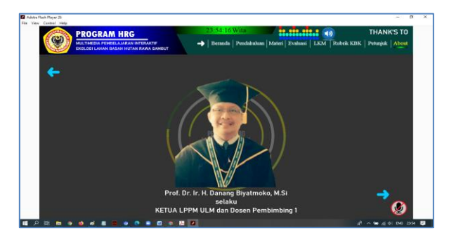
Figure 11 Display of Acknowledgments (1)