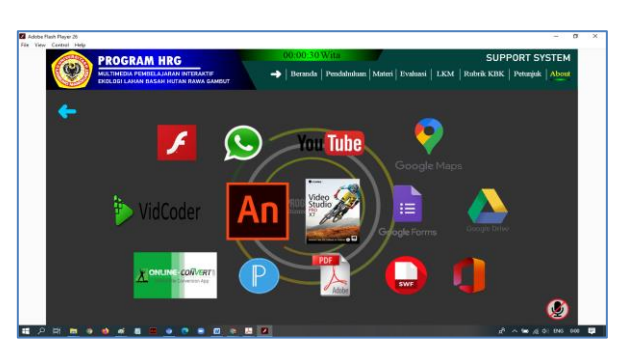
Figure 10 Display of Support System