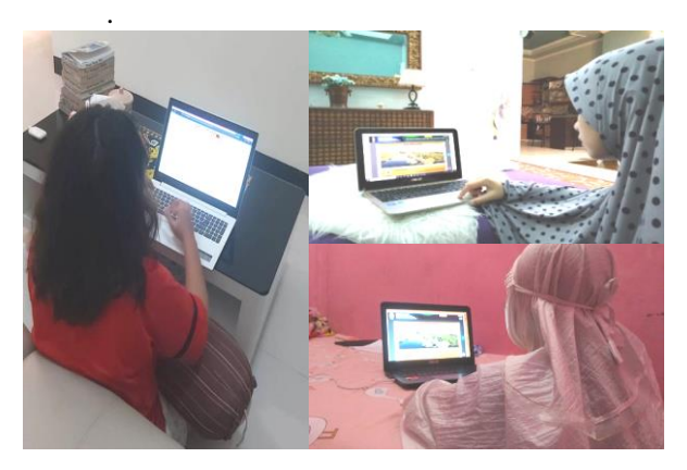
Figure 14 Student Readability Test

the extent of the readability and difficulty of the developed learning multimedia