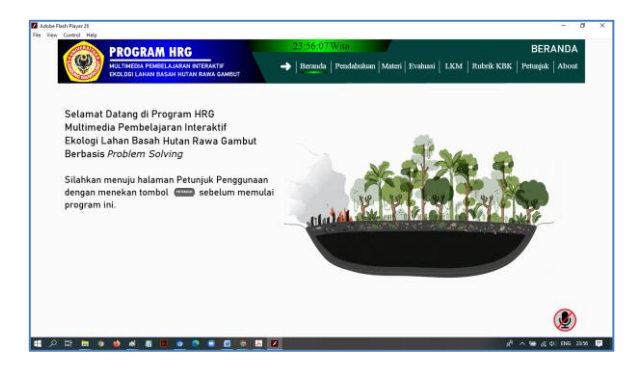
Figure 2 Main Home Display of Multimedia Draft Revision Results (After Validation)