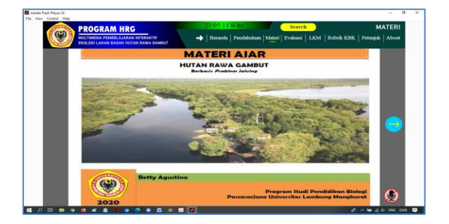
Figure 5 Display of Learning Materials