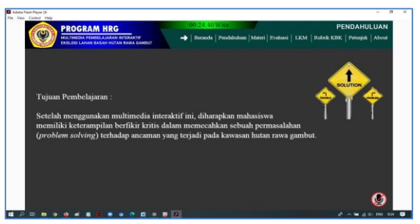
Figure 4. Introductory Views