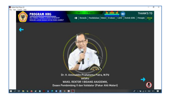
Figure 12 Display of Acknowledgments (2)