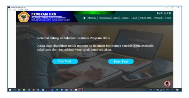
Figure 6 Display of Evaluation