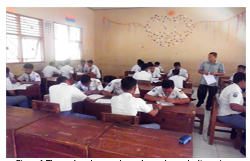
Figure 3 The teacher observes the students who are in discussion

What if the class consists of 27 students? The answer is still formed into five groups, the rest (the remaining two children) are assigned to another group. In other words, of the five groups that have been formed, two of them consist of six people. Apakah kelompok yang sudah berdiskusi ini dibiarkan sendiri melangkah atau bekerja . The answer is of course "no". This discussion remains under the supervision of a teacher, who oversees the discussion from the beginning, the process, and the end. A teacher is still responsible for monitoring the course of the discussion. Figure 3 below illustrates a teacher who always monitors the course of the discussion.