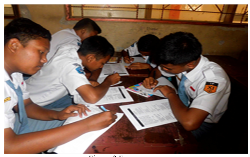
Figure 2 Form a group

After the class leader received instructions from a teacher (instructor), he immediately formed groups randomly. The formation of this group was not based on likes and dislikes (favouritism). However, the formation is random. The Figure 2 below shows how to form groups of 5 students.