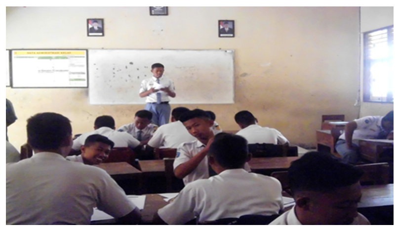
Figure 1 formation of discussion groups through class leaders

At this stage the researcher carries out actions in accordance with the plan, observes the implementation of learning, makes an inventory of the data based on observations and interpreting the data. The first step taken by a researcher (instructor), is not directly dividing the class, but giving directions to the students first. For example: what are the discussion steps that must be taken, how many members per group are, what is the topic, how is the process, and how to conclude it. To encourage this, then entrust the class leader to arrange it. Figure 1 below shows that students began to actively discuss by forming groups first.