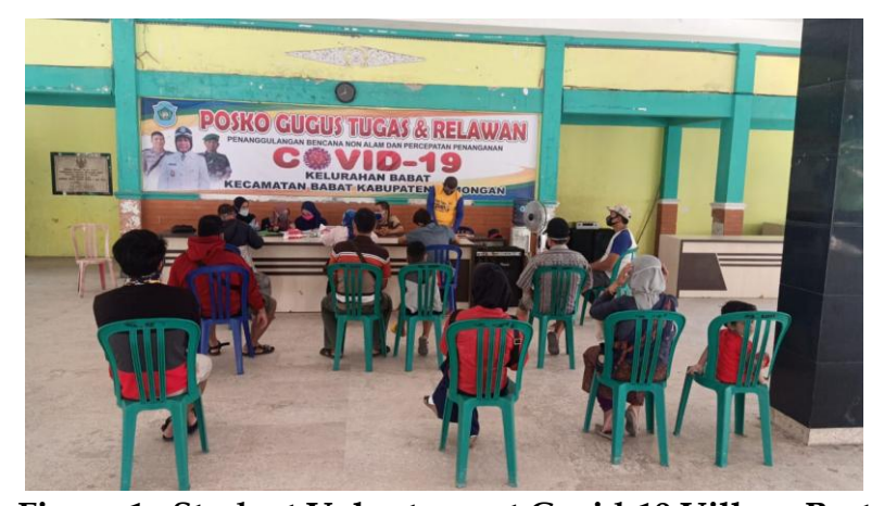
Figure 1: Student Volunteers at Covid-19 Village Post

In column 3 of the project program in the village, students seek to assist the village in preparing food and social security needs for the community as well as volunteering in realizing the village program in accordance with the village's medium-term plan. In column 4 of the teaching activities in the village, students are directed to help the community in optimizing online learning by accompanying school-age learners, developing literacy programs, and making breakthroughs in learning based on the growth of student creativity. Meanwhile, in column 5 of the technology and information innovation program in the prevention and handling of Covid-19, students are directed to minimize the spread of Covid-19 with online education through the creation of PPE and prevention and handling of Covid-19.