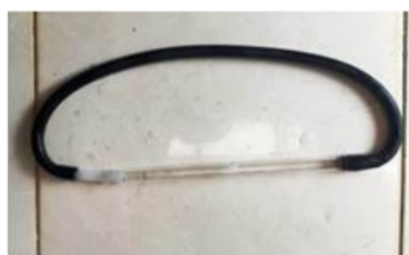
Figure 2. Aspirator 6

aspirator (Figure 2) device and a light trap uses a light (light trap) and then is inserted into bufferglass. 9 Volunteer samples are used as bait during fishing.