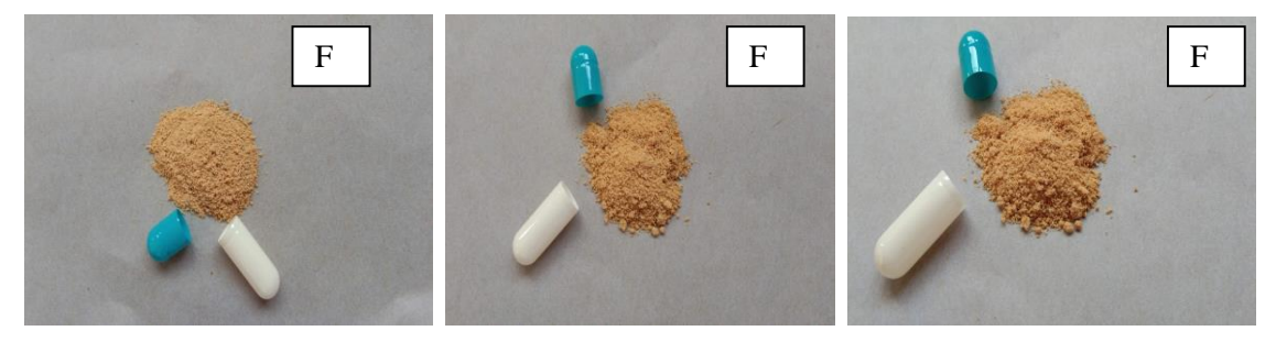
Figure 2. Result of Hygroscopicity Test for 3 months of storage

Figure 1 shows the hygroscopicity test applied on celery extract capsules of all formulas, where the capsules are stored in containers and packages used for storage and stored under controlled room conditions with a temperature of 25°C and 70% humidity. This hygroscopicity test was performed to determine how long the celery extract capsules were stable on storage. The results of the hygroscopicity test carried out for 3 months showed that all of the capsule formulas of celery extract were stable in tightly closed containers at 25°C and 70% humidity.