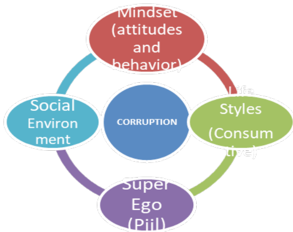
Graphic 3: Sociological Factor of Regional Head Corruption in Lampung Province

The organizational circumstances can also influence someone to corrupt. We see that anyone can be involved in corruption, both superiors and subordinates. If a leader does not have exemplary and integrity, this can be imitated by his subordinates. Corruption in Lampung is an interesting phenomenon because several regional heads have been caught doing corruption through OTT by the KPK. This corruption is not only created by corporations and DPRD members, but also by bureaucracy. We can see in graphic 3.