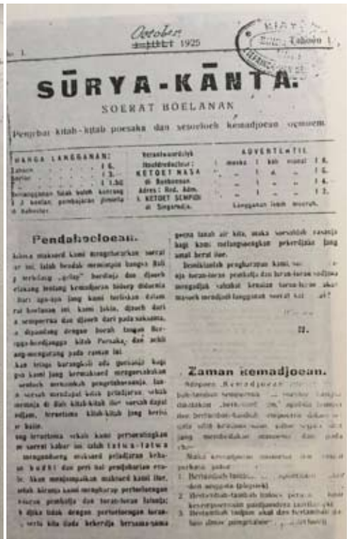
Photo 2. Newsletters Bali Adnjana and Surya Kanta.

Beginning in 1920s, the caste system had been debated by numerous Balinese scholars between the local magazines of Surya Kanta and Bali Adnjana . Surya Kanta and Bali Adnjana were local magazines, which was established in Singaraja in 1920s. These two magazines focused on the debates of the castes existence between