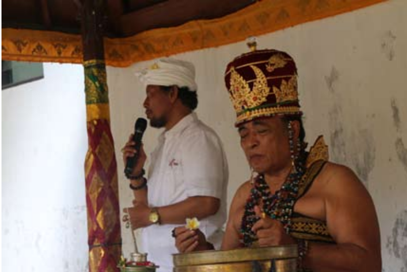
Photo 1. A brahmana priest officiates a temple ritual.