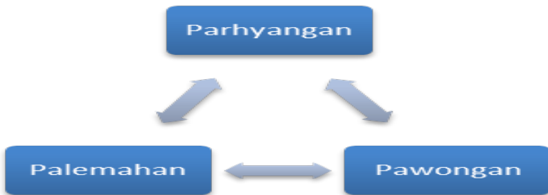
Table 2. The Concept of Tri Hita Karana

Balinese society is strongly believed in the relations between Gods, the individuals, and the environment. The relationship between the three aspects can be seen by the concept of Tri Hita Karana (three ways of peacefulness) that has the notion of (1) harmony to the God ( Parhyangan ); (2) harmony to people ( Pawongan ); and (3) harmony to the environment ( Palemahan ) (Access in http://www.thejakartapost.com/news/2010/03/15/nyepi-'tri-hita-karana'-and-development.html (5 December 2015)). The relationship of these three notions can be shown below: