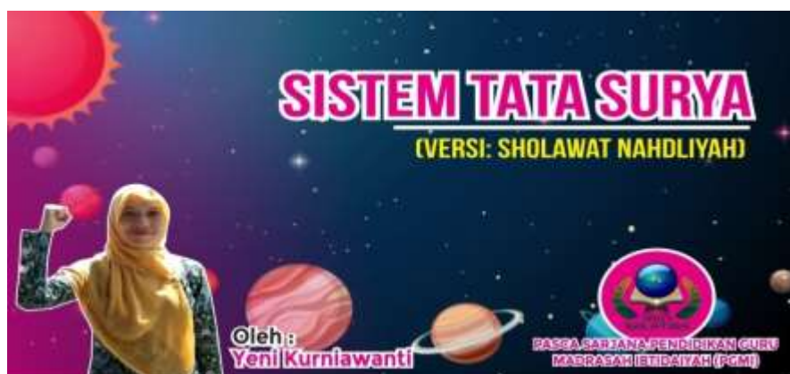
Figure 1. Front Cover

The development results describe that the form of proshow media based on poems and songs is in the form of a video album containing poems about solar system material is packaged in a variety of song variations and an attractive image display. Proshow media based on poem and songs from the solar system as a result of developments such as Figure 1 and Figure 2 .