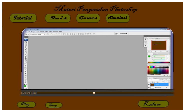
Figure 3: First Material Display