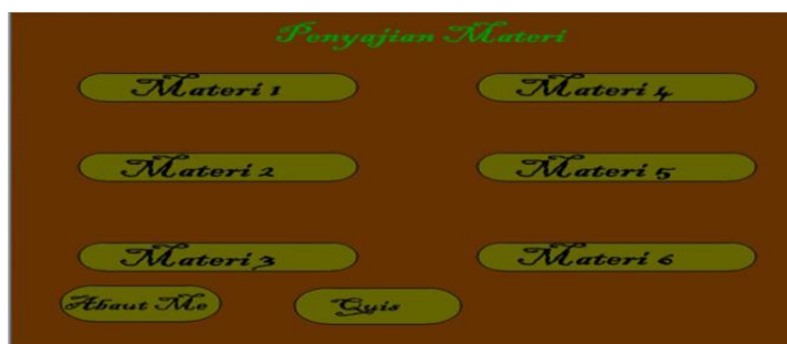
Figure 2 Display For Material Selection

The material selection form has several sub-menus that will be selected for the material to be discussed and the Quis sub menu will display the questions to be answered.