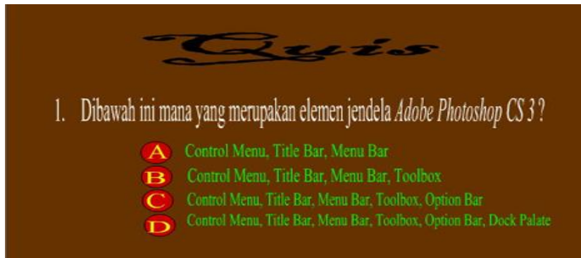
Figure 6 Quiz Display