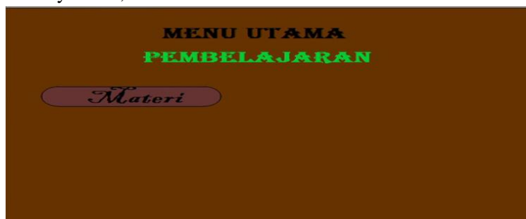
Figure 1 Main Application Display

The main application form is a form that contains buttons that contain sub-menus to run video tutorials, the application is designed to be as attractive as possible as the interface design so that it looks attractive and easy to use, here is the interface.