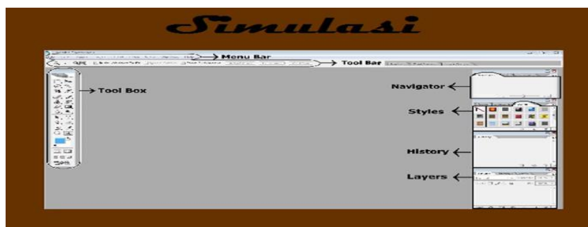
Figure 8 Simulation Display

This form displays a Photoshop CS 3 learning simulation