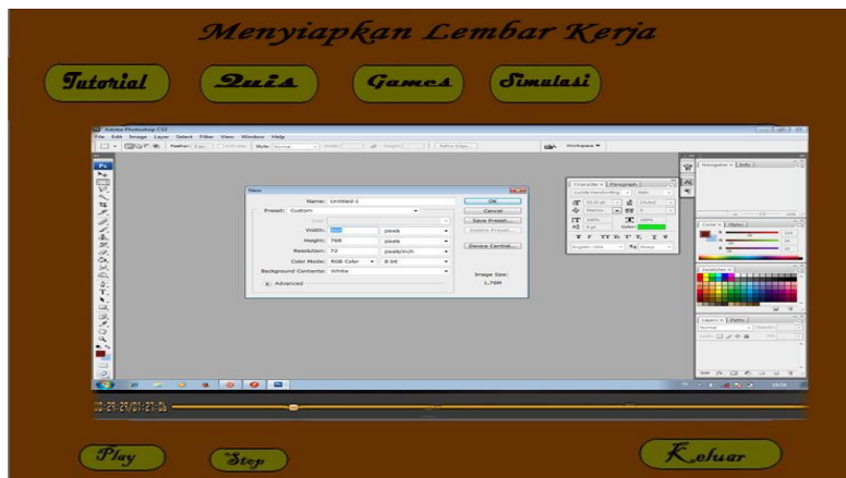
Figure 4 Material Display 2

The 2nd meeting form which contains a video tutorial that explains how to make a worksheet in the Adobe Photoshop CS 3 application