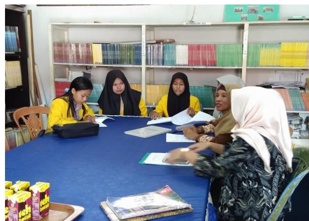
Reflection : discussing about what the students done or reaction from the instruction from the pre-service teacher