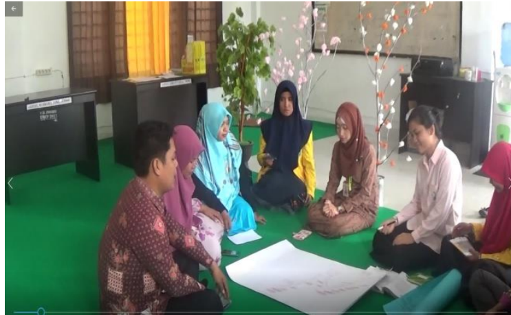
Plan: pre-service teacher, students, lecturers discuss about the preparation before teaching

The Process of Magang III based lesson study which build the collaborative activities between teacher, students, and lecturers shown as follow: