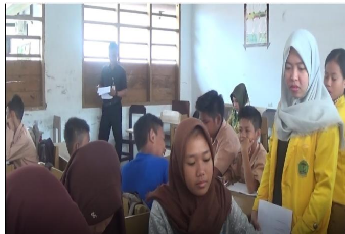
Open class: The lecturer and pre-service students observed how the students learn