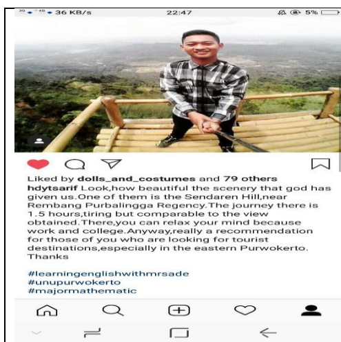
Figure 3. Student's caption

skill. They can explain the picture. It can be the way to increase their writing skill.