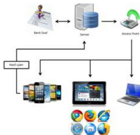
Picture 1. Draft of WBE testing system

Before showing the result of the research, the researcher did need analysis in which to know the weaknesses of the testing system used in English Department. Then, he interviewed lecturers and students related to the testing system used. From the observation and the interview, the researcher did early data. The next step is drafting the system by consulting it with IT expert to make a computerized testing system which can handle the problems found in conventional testing system. The main features of the system are login/registration, question bank, inserting media (picture and sound), time controller, auto correction, monitoring, and users. Below is the draft of the system: