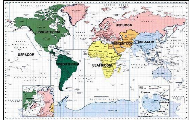
Figure V. The Unified Command Plan