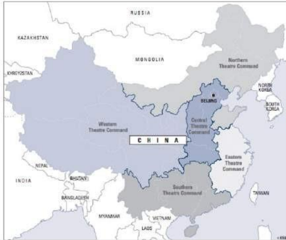
Figure III. Illustration of PLA Theatre Commands