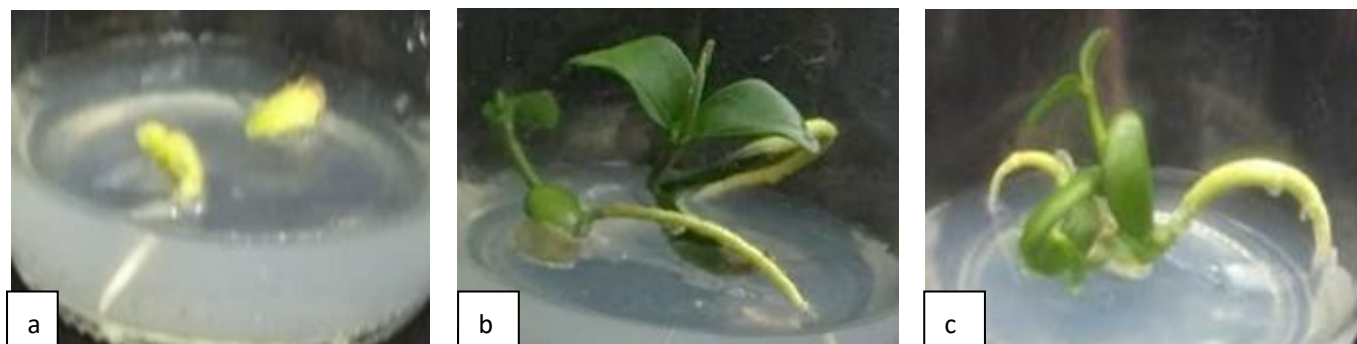
Figure 1. The appearance of seed germination in vitro in MS media without GR (MS0). Seed germinated at 7 weeks after application (a); Seed germinated at 4 weeks after application (b); Seed germinated at 5 weeks after application (c)

best concentration in inducing the shoot growth of mangosteen in vitro . The results of pomelo seed germination shown in Figure 1.