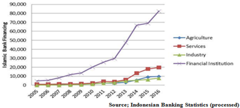
Figure 1. Islamic Banks financing for economic sectors in Indonesia 2005-2016 (in billion Rupiah)

The development of Islamic bank financing is expected to improve the economic structure. Financing in the agricultural sector is still being a main reason for increasing jobs. Financing of Islamic banks in the agricultural and industrial sectors continued to increase by the average growth of 19.27% and 26.04% per year (Figure 1). Despite the increase, the share of Islamic bank financing allocation for agriculture and industry sectors was still very small. Islamic bank financing portfolio for agriculture and industry sectors averaged 3.02% and 4.12% per year, much lower than the portion of Islamic bank financing in the service sector which reached 29.76% per year.