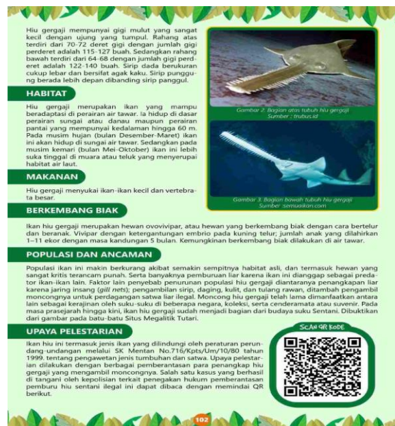
Figure 2. Book content example of Satwa Negeriku encyclopedia.

Content of the encyclopedia consists of some components (Figure 2), which are: 1) Book identity page explains book identity, such as book title, writer, designer, and layout designer of the book. 2) Introduction page contains writer's introduction about purpose and expectation for Satwa Negeriku Encyclopedia. 3) Content page contains list of contents from Satwa Negeriku Encyclopedia that can help user to find the desired page in the book. 4) Using QR code instruction page contains instruction using QR code in the book with the help of a smartphone. 5) Material page contains 15 endangered animal materials cover general condition, morphology, habitat, food, behavior, breed, population, and threat, as well as conservation effort. 6) Glossary page contains list of word/foreign term needed to be explained further. 7) Bibliography contains of bibliography and data source of the encyclopedia. 8) Writers identity contains short description of the writers' identity.