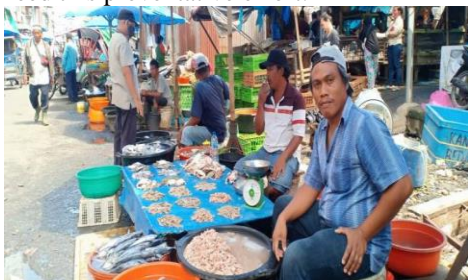
Fig 3. The trader who does not wear a mask during a trade transaction at the Karan Fish Auction Market.

Evaluation: 1) COVID-19 preventive implementation generally goes as planned; 2) while conducting preventive measures, there are still many people who do not behave well in the prevention of the spread of Coronaviruses, such as not keeping the distance at the time of communication, there is a gathering of citizens who are more than 5 people without wearing masks, and 3) when providing counselling to shop owners/stalls at the fish auction where the importance of providing water and soap for hand wash ready actions. In general, the shop/shop will apply the action, but there are also found shops/stalls that do not heed this preventative effort.