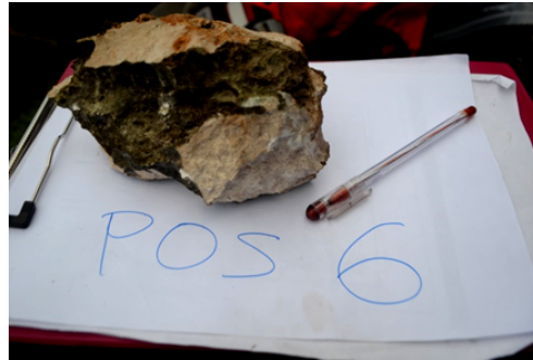
Figure 7. Sample 6, Limestone Bioturbation