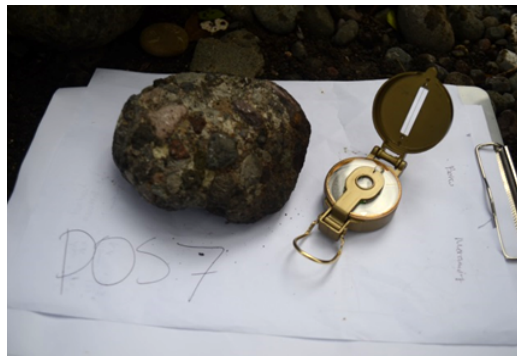
Figure 8. Sample 7, Breccia