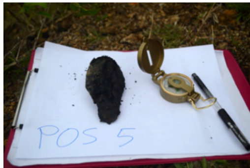
Figure 6. Sample 5, Coal