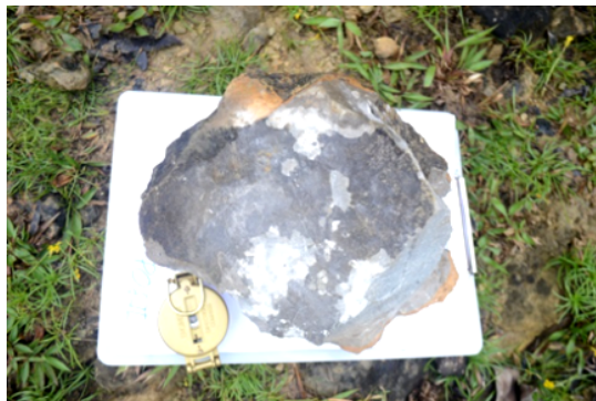
Figure 3. Sample 2, Limestone Sand