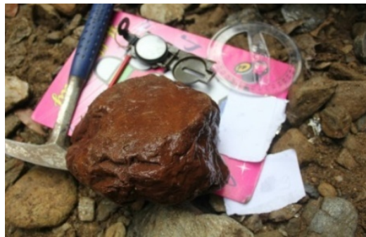
Figure 11. Sample 10, Chert stone

Beside the weathered and fresh color, we also identified another rock physical properties from the samples by direct observation. Another rock physical properties from the samples that we identified can be found in Table 1.