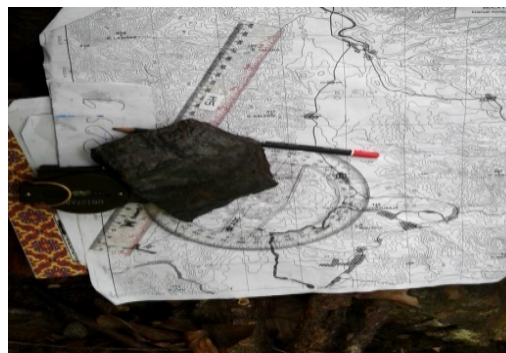
Figure 9. Sample 8, Greenschist