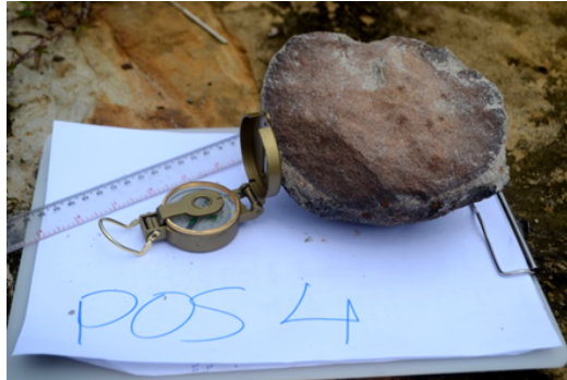
Figure 5. Sample 4, Sandstone

because it indicates that in this rock the oxidation process occurs so that the color changes. The vegetation is grass with the sloping topography. The position of this rock is 119^{\circ}42'13.4''\text{E} and 4^{\circ}30'10.7''\text{S} .