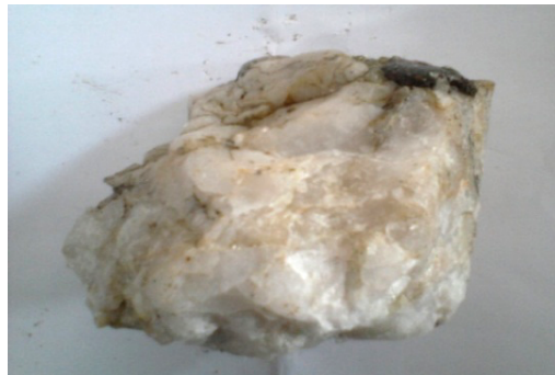
Figure 10. Sample 9, Quartzite