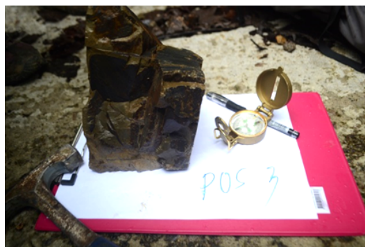
Figure 4. Sample 3, Shale