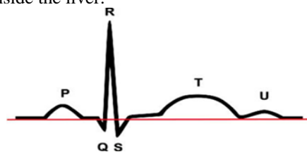
Fig 1. ECG Signal Normal Wave

The race or SA node generated the signal to create an atrium contract simultaneously. The signal will be delayed in the AV node to ensure the completion of the atrium is completed and their space completely emptied. Then, the signal is done for the cardiac apex with Purkinje fibers and the bundle branch. When the spread of signals across the ventricle, it would be a contract from top to top. Signal results will be recorded as an EKG signal. ECG can be defined as a non-invasive device used to measure and monitor the electrical activity of the heart through the skin. A wave is produced by an electrocardiogram. This particular wave is in response to the electrical changes that occur in the liver. The electrical changes that occur in the liver that are used to detect problems begin with the environmental changes of the ionic liver. Followed by the decompression system of cardiac conduction with the breakdown of muscle fibers due to lack of blood supply then some heart disease detected. The waves produced by the monitoring electrocardiogram indicate the electrical changes occurring inside the liver.