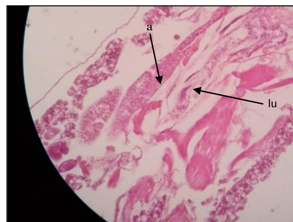
Figure 2. Longitudinal Section of Normal Midgut of Ae. aegypti Larvae Instar IV (10x). a:Midgut Epithelial; lu:Midgut Lumen

Normal midgut showed that there was no destruction in the midgut epithelial cells of larvae (Figure 2). The effects of O. sanctum leaf extract towards the anterior and posterior midgut epithelial cells were examined and showed that there was destruction in the midgut epithelial cells of the treated larvae (Figure 3).