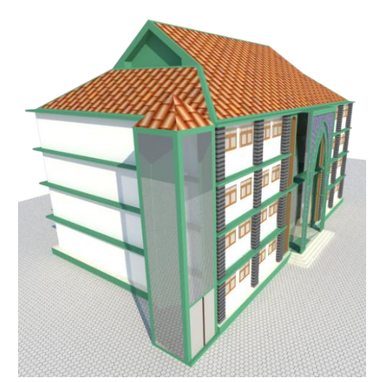
Figure 2. Building on the Fourth Floor with an Elevator Design Outside.

feels like it will be scary/lethargic, then there should not be coercion in this case. To overcome this, then try to make the design of making a ladder outside the building so that when going up to the top room (fourth floor) there is no stepping over so that there is no sense of lethargy. For buildings that are used for many people such as halls, offices, etc., a building design can also be made with the installation of elevators outside the building, so when you want to go up to the fourth floor you can go directly through the elevator without anyone stepping over to avoid taste, like the following picture: