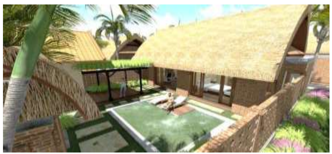
Fig. 5. Design in Optimizing the Utilization of Natural Energy in the Suite Room

In the suite room residential units strongly apply the principles of ecological architecture from climate sensitivity and energy saving from optimizing the use of natural energy from sunlight and wind as a media for lighting and natural ventilation from the application of the lotter on the roof as a medium for air entry, mini placement pool at the center of the unit area as a medium for light reflection and the use of easily available materials such as bricks, wood and reeds that are able to harmonize with the climate on the site.