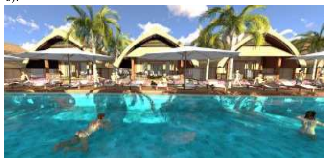
Fig. 6. Design in Optimizing the Utilization of Natural Energy in the Suite Room

There is the last type in the suite room class, which is a junior suite room which is a room unit with 1 bedroom, 1 bathroom and terrace facilities but has the closest access to the main pool and has a direct view orientation to Setangi Beach with a typical building view sasak barn. (see figure 6).