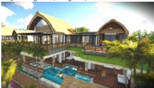
Fig. 4. Special Emphasis on Design of an Ecological President Suite Room

President suite room is one of the four types of room units in the resort and one of the room units with the most complete facilities with 3 bedrooms complete with open bath tub, family room, dining room, pantry, mini pool, relaxing area, yoga area and a sunbathing area with a 2 story building view (see figure 4).