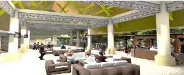
Fig. 2. Emphasis on Principles Sensitive to Climate and Energy Saving in

The emphasis of the principle of environmentally friendly buildings conical on how to design buildings that are able to be sensitive to climate and save energy. [4], said that one of the environmentally friendly buildings applies ventilation in the building which as a medium for lighting and natural maintenance of the building as well as to support the comfort of the community.