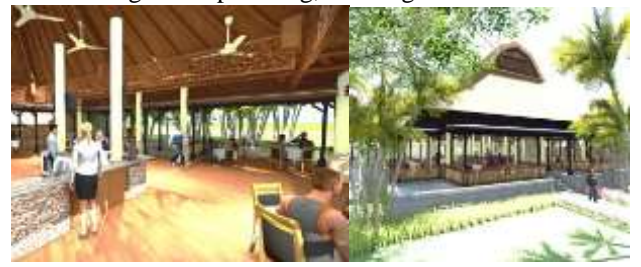
Fig. 3. Emphasis on Principles Sensitive to Climate and Energy Saving in Lobby Buildings (source: Subagya)

There are several types of supporting facilities, one of which is a facility that serves as an area that accommodates the activity of eating, drinking, hanging out and relaxing. Restaurants in the eco resort as a place to accommodate eating and drinking activities, small meetings, and relaxing for guests who stay overnight or not. This restaurant also needs to adopt the principles of being sensitive to climate and saving energy from the design of the building's own planning, as in figure 3.