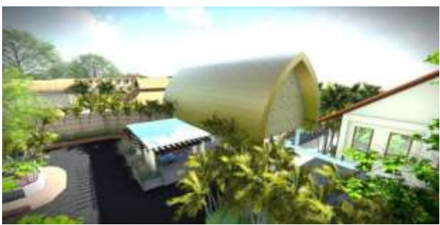
Fig. 1. Exterior appearance of the Lobby Building

The lobby is a supporting facility at the eco resort that serves as a place to receive the first time in a resort which at the same time as a facility that gives a first impression or first impression to visitors, so the lobby must be able to lift and strengthen the local local atmosphere both architectural and environmental values around with the appearance of Sasak barns which are developed both from the dimensions, structure and use of materials. (see figure 1).