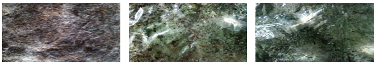
Fig 2. Formation of Mycelium In Substrates Based on Palm Waste (Yunilas et al., 2014)

Fermentation biotechnology using MOIYL based on plantation waste and palm oil industry at various substrate level combination treatments showed significant results on the content of neutral detergent fiber (NDF) and acid detergent fiber (ADF). The effect of complete fermentation of plant based waste and palm oil industry using indigenous microorganism YL ( Bacillus sp YLB1, Trichoderma sp YLF8 and Yeast sp YLY3) can be seen in Figure 2.