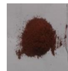
Robusta roasting coffee powder

Characteristics of roasted Robusta coffee powder has a rather coarse powder, brown color, bitter taste, and distinctive aromatic odor.